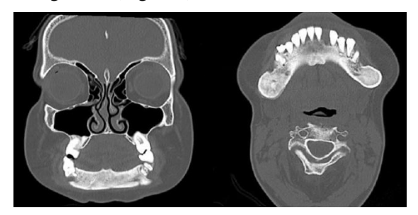
Fig1: Face CT scan with bone windowing in coronal and axial sections showing homogeneous diffuse bone sclerosis of the mandible, with fat obliteration of bone marrow without cortical thickening.

The patient's CT scan of the face showed relatively homogeneous bone sclerosis, diffuse body and branches of the mandible, fat obliteration of the bone marrow without cortical thickness, bilateral condylar hypoplasia, and retrognathia (Figs.1,2).