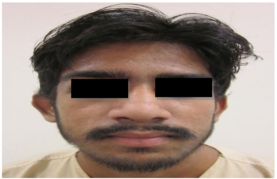
Fig 4: Postoperative photograph showing complete resolution of the subperiosteal abscess

The fever subsided after 48 h of surgery, and neurological symptoms began resolving after 7 days. The patient subsequently underwent regular physiotherapy for foot drop. A repeat CT scan was advised after 2 weeks, and revealed a reduction in the size of the abscess. The patient was discharged after 28 days of medical treatment with complete resolution of the intracranial abscess and foot drop. The patient remained on close follow-up for last 12 months in the rhinology clinic and was found to be completely asymptomatic, both clinically and radiologically (Figs 4,5).