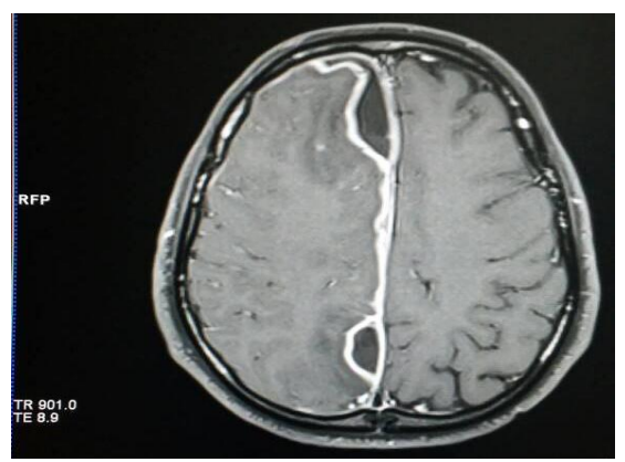
Fig 3: Magnetic resonance image (MRI) of the brain revealing a ring-enhancement lesion in the parasagittal area of right frontal lobe.

An MRI of the brain revealed ringenhancement lesion in the parasagittal area of right frontal lobe without significant displacement of the midline (Fig.3).