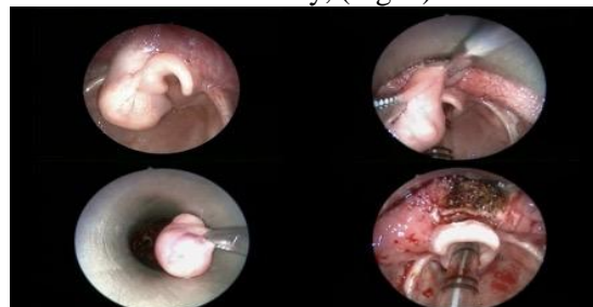
Fig 1: Sequence of microlaryngoscopic resection of the lesion. Endoscopic transoral excision of the lesion was performed through cold dissection plus electrocautery

in the vallecula, the patient underwent a direct laryngoscopy (Fig.1). Endoscopic transoral excision of the lesion was performed by cold dissection plus electrocautery (the FiO 2 was previously decreased to 30% preventing the combustion of the airway, (Fig. 1).