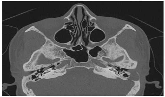
Fig 2: HRCT Temporal Bone revealing erosion of posterior wall of external auditory canal by Cholesteatoma.

external auditory canal eroding the posterior wall and extending into the mastoid bone impinging on the sigmoid sinus plate (Fig.2).