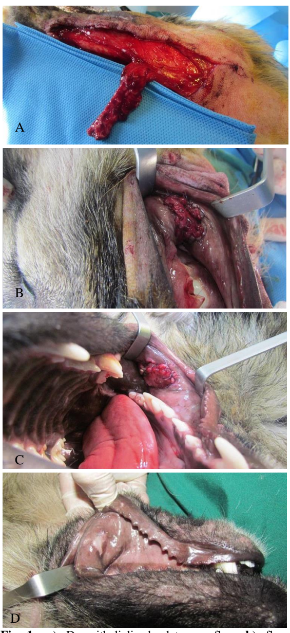
Fig 1: a) De-epithelialized platysma flap, b) flap adaptation to recipient bed, muscle part facing the oral cavity, c) a photograph taken a week after operation, d) presentation of hypopigmentation 40 days postoperation