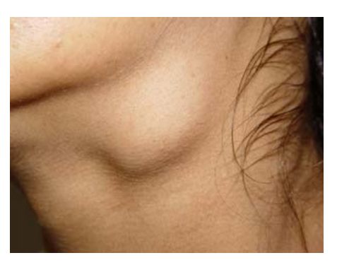
Fig. 1- Left side neck mass of the patient

Tel: 0511-8022517 E-mail: e_khadivi@yahoo.com Acceptation date: 1385/6/13 Confirmation date: 1386/8/13