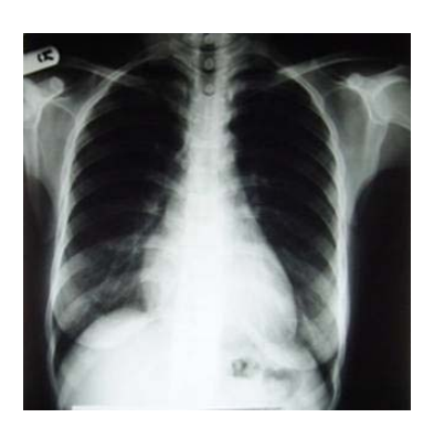
Fig. 2- Chest x-ray of the patient

Laboratory data revealed WBC: 6300.UL Hb: 4.8g/dL Hct: 17.3% MCV: 63.84 FL MCH: 17.71 Pg MCHC: 27.76% Urea: 147mg.dL Cr: 6.8mg/dL, ESR 1hr: 63mm/hr and proteinuria (++) and W.B.C: 15-20 in urine analysis. All other laboratory tests were in normal range. She denied smoking, risk factors for HIV and recent exposure to tuberculosis. Abdomen and kidneys sonography showed bilateral small nonlobulated kidneys with no other abnormality in abdomen. PPD test was 10mm. Lateral neck x- ray was normal. Neck sonography revealed multiple bilateral solid masses (the largest was 28mm in the right side and 19mm in the left).