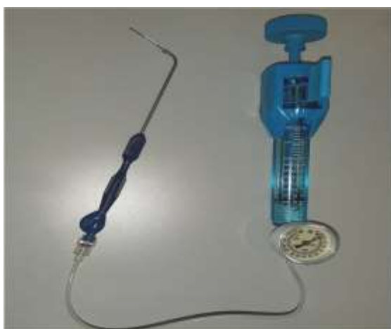
Fig3: Pressure device (Inflation pump) which is attached to the balloon catheter.

The balloon was emptied and removed. The aim was to dilate the cartilaginous part of the eustachian tube without any structural damage. The successful technique is always associated