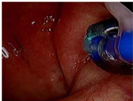
Fig2: Balloon catheter is pushed into the cartilaginous part of the Eustachian tube.