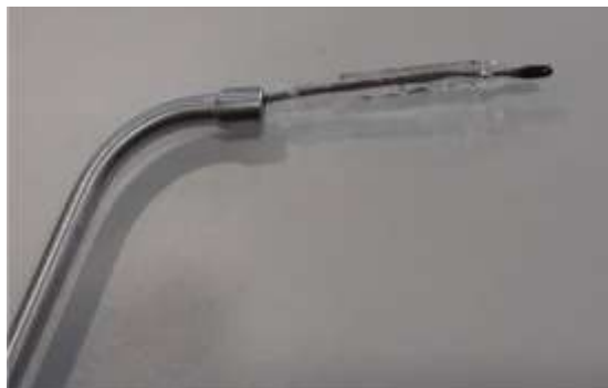
Fig1: Balloon catheter for eustachian tube dilation.

orifice of the ET (Fig.2). The balloon was inflated by sterile water with a pressure of ten bars for two minutes by help of pressure device or inflation pump (Fig.3).