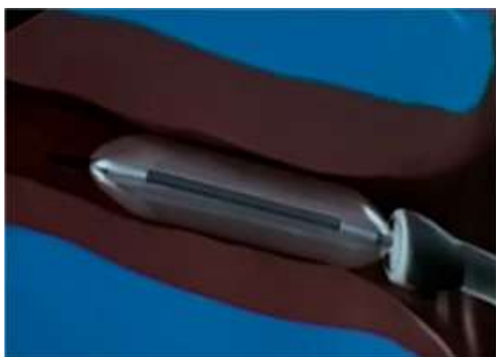
Fig 5: Cartilaginous part of the Eustachian tube during balloon dilation.

This is done under transnasal endoscopic vision. So optimum care should be taken not to push the balloon catheter past the cartilaginous part of the ET and bony isthmus or to use large size balloon which too large for the patient. Balloon eustachian tuboplasty is less invasive in comparison to laser or microdebrider Eustachian tuboplasty. The mechanisms for eustachian tube balloon dilation include both widening of the cartilaginous part of the ET and histopathological changes (15) (Fig.5).