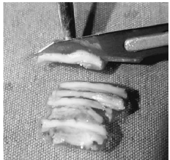
Fig 1: Photograph showing preparation of the cartilage.

In the patients who underwent palisade cartilage tympanoplasty, conchal cartilage was used in all cases. The perichondrium was removed from one side of the cartilage, and the cartilage was then cut into several slices with, on average, four or five palisades placed in an over-under fashion (two placed anterior to the malleus handle and two or three placed posteriorly). The remaining perichondrium was left attached to the cartilage slices on the lateral side. The perichondrium layer removed at the beginning of the procedure was then laid on the cartilage palisades, so that all the unwanted small openings between the slices were covered to improve the healing process. In the patients who underwent tympanoplasty where the temporalis muscle fascia was used as a grafting material, the graft was from the ipsilateral deep harvested temporal muscle fascia and placed lateral to (over) the long process of the malleus and medial to (under) the drum remnant and anterior annulus. Gelfoam was placed both medial (to the middle ear) and lateral to the graft, and the wound was closed using absorbable sutures. Figure 1 shows the preparation of the cartilage strips and Figure 2 shows a schematic image of the palisade cartilage tympanoplasty.