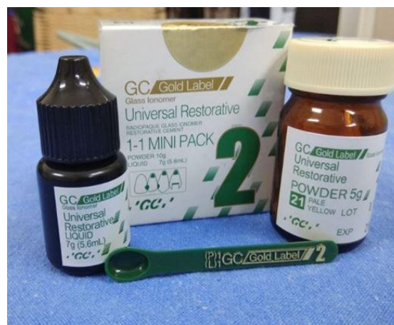
Fig 1: Glass Ionomer Cement

The post-auricular approach was used. After harvesting the temporalis fascia/conchal cartilage graft, the middle ear was examined for any pathology. During the surgical procedure, the condition of the ossicular chain was noted, and any incudo-stapedial gap was reconstructed using GIC. GIC comprises two containers of powder and liquid each (Fig.1).