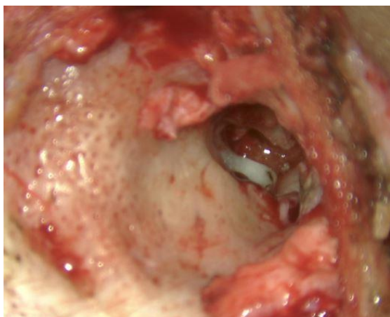
Fig4: Intraoperative Photograph Showing Incudostapedial Joint Restoration after Glass Ionomer Cement Application.

Antiseptic dressing was done. Patients were observed for graft uptake and any complications at 4th, 6th, and 12th weeks of