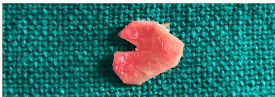
Fig 1: Harvested tragal perichondrium cartilage composite graft

while in group B tragal cartilage along with medial perichondrium was used (Figure 1). Cartilage slicer (Figure 2) is used to reduce the thickness of harvested graft to 0.5mm.