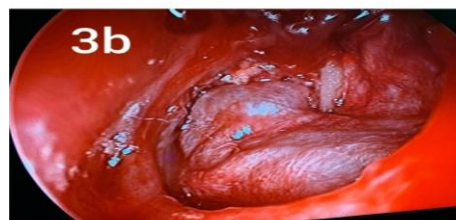
Fig 3: a. Tragal perichondrium cartilage composite graft in left ear after repositioning of tympanomeatal flap. b. Tragal perichondrium graft in left ear after repositioning of tympanomeatal flap