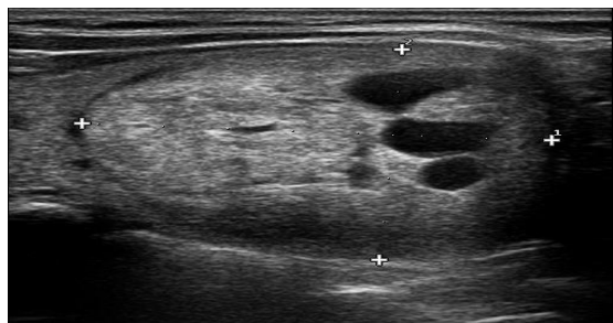
Fig 1: Ultrasonographic appearance of TI-RADS III nodule; they are solid or almost solid, iso-, or hyperechoic, well-defined oval shape nodule without echogenic foci.

Patients in other TI-RADS categories and those whose information was not properly retrieved at each stage of sample collection were excluded from the study. Statistical analyses were performed in SPSS software (version 16; SPSS Inc. Released 2009. PASW Statistics for Windows, Chicago: SPSS Inc.). Continuous variables were expressed as mean \pm SD and categorical variables as numbers and percentages. The Chi-Square test was used to examine the relationship between qualitative variables and p-values of <0.05 were considered as the significant level in all tests.