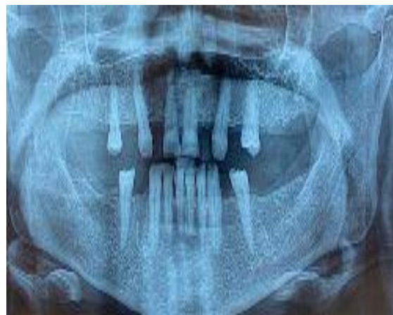
Fig 2: The mandibular bone was intact in panoramic radiography.

The jawbone was intact in panoramic radiography (Fig 2).