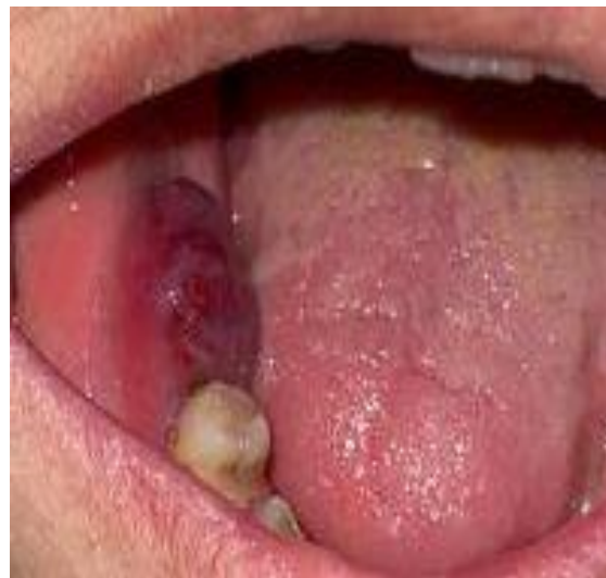
Fig 1: Photograph shows a bluish-purple mass covered by mucosa extended from the distal of the right second premolar

The hematologic examination was normal except for a low platelet count ( 129000 \times 10^3/\mu^l ). ESR was within the normal range (11 mm/h), and CRP was 3+. Intraoral examination showed a painful bluish-purple mass covered by mucosa with soft consistency extended from distal of right second premolar to retromolar pad region measuring about 2\text{cm} \times 1\text{cm} with two months duration (Fig 1).