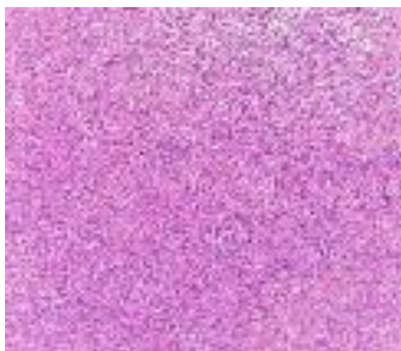
Fig 4: Microscopic sections show sheets of atypical spindle and some epithelioid cells with pleomorphic nuclei ( \times 100 ).

Due to her medical history, the provisional diagnosis of the metastatic tumor was made and an incisional biopsy was performed under local anesthesia. Evidence of bone involvement was seen during surgery. On gross examination, the lesion was fragile and brown like granulation tissue with soft to elastic consistency. Microscopic examination showed a malignant mesenchymal neoplasm composed of sheets of atypical spindle and some epithelioid cells with pleomorphic and hyperchromatic nuclei. In addition, giant tumoral cells, many mitotic figures, and foci of necrosis were also seen (Fig 4).