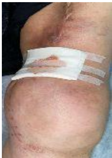
Fig 3: Photograph of the thigh after the tumor recurrence.

Due to her medical history, the provisional diagnosis of the metastatic tumor was made and an incisional biopsy was performed under local anesthesia. Evidence of bone involvement was seen during surgery. On gross examination, the lesion was fragile and brown like granulation tissue with soft to elastic consistency. Microscopic examination showed a malignant mesenchymal neoplasm composed of sheets of atypical spindle and some epithelioid cells with pleomorphic and hyperchromatic nuclei. In addition, giant tumoral cells, many mitotic figures, and foci of necrosis were also seen (Fig 4).