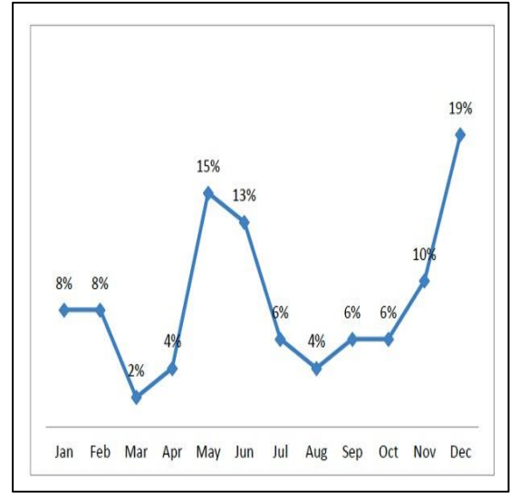
Fig 1: Month-wise presentation of patients based on the date of hospitalization

Out of a total of 52 patients with sino-nasal mucormycosis; 33(63%) were male and 19 (37%) were female patients with a mean age of 41.3 years and an age range of 2 to 70 years. On analyzing the seasonal pattern of presentation, we found two peaks, one in winter (19% of cases in December) and another in summer (28% of cases in May and June) as depicted in Figure 1. Most common systemic illness found in our study was diabetes in 38 (73%) cases followed by hematological malignancies in 3 (5.7%) patients and CKD in one patient. No underlying cause of immunosuppression could be ascertained in 10 (19%) patients. Out of these 10 patients, six patients were under the age of 30 years.