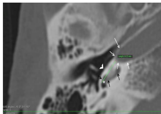
Fig 1: Axial CT image of temporal bone illustrating the method of measuring round window to carotid canal distance (RCD) which is represented by the green straight line. Note that the measurement is the shortest distance from anterior margin of round window (asterisk indicates round window) to the carotid canal (white arrows) and parallel to the promontory (open white arrowhead). The black arrows point at the Basal turn of cochlea.