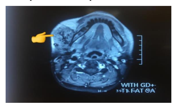
Fig 1: T1-weighted FAT-SAT axial sequence showing an irregular enhancement following the medium contrast uptake (Pointer)

An embolization procedure suggested a vascular mass presence and led to the shrinkage of the mass. The patient underwent a Total parotidectomy with the facial nerve preserved. and the specimen was sent to the pathology laboratory. The specimen was sent in formalin in two separate containers and consisted of:1-Multiple fragments of irregular brownish soft tissue measuring 2.6 x 2.4 x 1.4 cm and 2-One fragment of irregular grayish-creamy soft to rubbery tissue measuring 3.3 x 2.8 x 1.2 cm. T1weighted FAT-SAT axial sequence shows evidence of a tumor in the parotid (Figure 1). Microscopic diagnosis suggested a Deep parotid hemangioma). vascular mass (Masson's Moreover, the gland was free from a tumor (Figure 2). No signs of necrosis and mitoses were perceived. Postoperative follow-up and visits proved the resection was successful, and the patient did not mention any adverse effects or complaints after the operation.