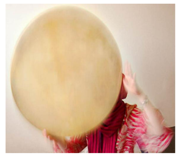
Fig 1: A daf player

tuned (Figure1). To date, no article has analyzed the daf intensity and frequency range and its effect on the vestibule. Thus, our aim is to use cVEMPs to evaluate the possibility that daf music may have a disturbing effect on saccular function.