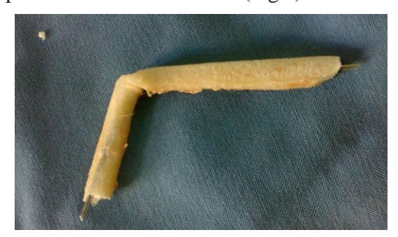
Fig1: Integrated wired rib cartilages in a shape of L-strut.

In this technique, after the 10<sup>th</sup> and 11<sup>th</sup> rib cartilages were harvested from the left side of the chest wall, with the 10<sup>th</sup> cartilage being carved for the dorsum and the 11th cartilage being carved for the columella. Then using a microdrill, the 0.035 inch Kirschner wire was passed through the core of both pieces of the prepared grafts. Then Kirschner wire was placed at approximately a 115 degree angle as an L-Strut. The Kirschner wire should have 5 to 8 mm of protrusions from both ends (Fig.1).