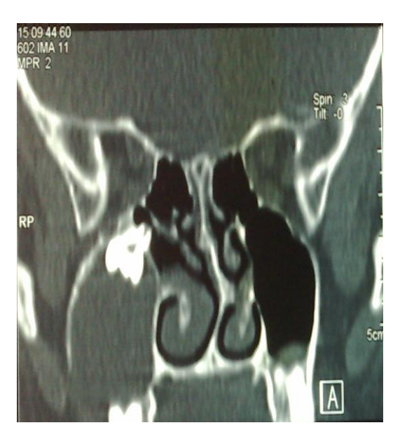
Fig 1: Ectopic tooth near ostium

Previous imaging was studied again and in panorex X-Ray an opaque mass was seen near the right maxillary sinus antrum, which was missed during previous visits. CT scan revealed a dense mass resembling tooth,near the accessory sinus ostium with near total opacification of maxillary sinus. Anterior and lateral walls had been eroded in lower cuts (Fig. 1).