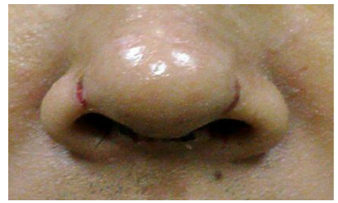
Fig2. One week post op view: pressure-sore wound on nasal soft triangles

Otorhinolaringology, Faculty of Medicine Building, University of Malaya, Kuala Lumpur, Malaysia *Correspondence Author: