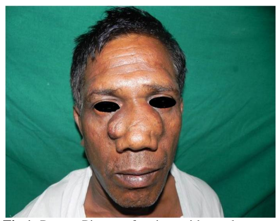
Fig 1: Pre op. Picture of patient with nasal mass

A 54-year-old male resident of Bhilai, India presented with complaints of an insidious onset of a gradually progressive swelling of the nose since 4 years and a similar swelling behind his right ear since 1 year (Fig.1).