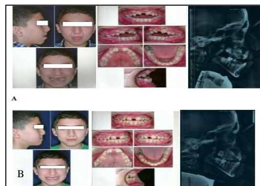
Fig4: Patient2. A, Pre-treatment facial and intraoral photographs. B, Post-treatment facial and intraoral photographs.