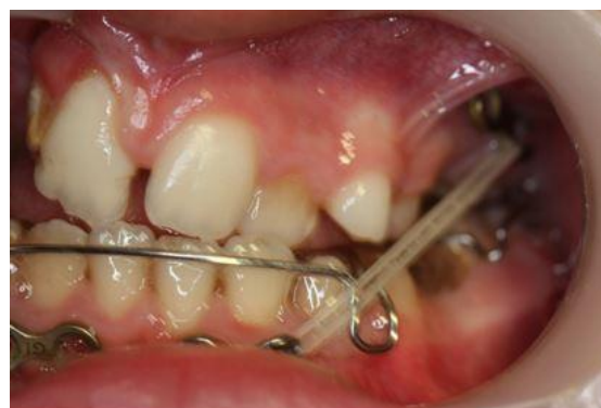
Fig 2: The application of intermaxillary elastic to the miniplates.

appliance full-time except for eating, contact sports, and tooth brushing; he was also told to replace the elastics every day (Fig.2). The traction force was doubled after 1 month, and the final 250g of force per side was reached after 2 months. Skeletal and soft tissue analyses were performed on pre-treatment and post-treatment cephalograms (15,16).