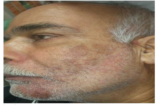
Fig 3: Patient extraoral view showing erythema and scar formation on the left side of the face.

A 54-year-old man, who had a history of hypertension and uncontrolled diabetes for ten years, was referred to the oral and maxillofacial surgery department, in the Mashhad Dental School, for managing exposed necrotic bone around the remained roots of the left lower teeth. He declared that the left premolar teeth exfoliated spontaneously two weeks ago. The patient's medical history revealed that herpes zoster infection had arisen a month ago, in the second and third division of the trigeminal nerve. The patient had been treated with intravenous acyclovir by an infectious specialist. Extra oral examination revealed erythema and scar formation in the left side of the face restricted to the distribution of V2 and V3 trigeminal nerve dermatomes (Fig.3).