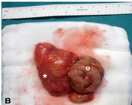
Fig 3: Gross image of the surgical resected specimen with clear evidence of the intraoral part (white circle) and the cervical part (white star) of the lesion

Tracheotomy was performed temporarily in order to prevent eventual postoperative dyspnea and was closed in 8 days later. Tumor size was 60 x 55 x 32 mm and the cross-section showed a “fish flesh” soft tan appearance.