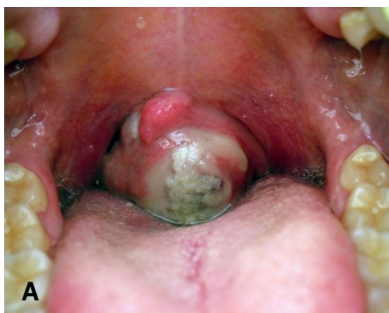
Fig 1: Intraoperative examination shows an anterior bulging of the left posterior pharyngeal wall due to the presence of a large mass with central mucosal ulceration and remarkable reduction of the oropharyngeal space.

A 36-year-old woman was admitted to our department with a 3-year history of a foreign body perception in the throat with gradually progressing dysphagia, associated with occasional odynophagia. A significant weight loss (6 kg) in the previous 2 months occurred. Physical examination revealed an anterior bulging of the left posterior pharyngeal wall due to the presence of a large, smooth mass, with central mucosal ulceration, causing a remarkable reduction of the oropharyngeal space (Fig. 1a).