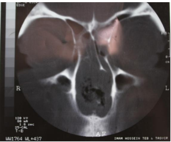
Fig 1: Radiologic view of the patient's paranasal sinus

The patient's erythrocyte sedimentation rate was normal and the following tests produced no pathological results: complete blood count, liver and renal function tests, serology for syphilis, bacteriological cultures including stains for fungi and tuberculosis, chest radiograph, extensive urine analysis, examination of rheumatoid factors as well as antinuclear and antimitochondrial tests. In an endoscopic examination a large septal perforation accompanied by excessive necrotic tissues in the nasal space was obvious (Fig. 2).