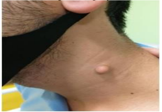
Fig 1: Macroscopic findings showing a pedunculated and firm papule located at the left lateral of the neck.

A 21-year-old male presented with a chief complaint of a left neck mass since childbirth. His history included an uneventful full-term pregnancy, normal vaginal delivery, and no other congenital defects. Family and medical histories had no remarkable findings. There were no other congenital deformities and no complaint of hearing loss. Routine head and neck region examination revealed a mass at the level of thyroid cartilage on the anterior middle 1/3 border of sternocleidomastoid (SCM) (Figure 1). The mass had changed neither in size nor in consistency since childhood. The patient had not reported a history of infection or inflammatory changes in his neck mass. It was painless with no fluctuation in size or discharge. It was 1*1 cm in dimension with smooth surface texture and normal surrounding skin. Moreover, it was not moving with tongue protrusion.