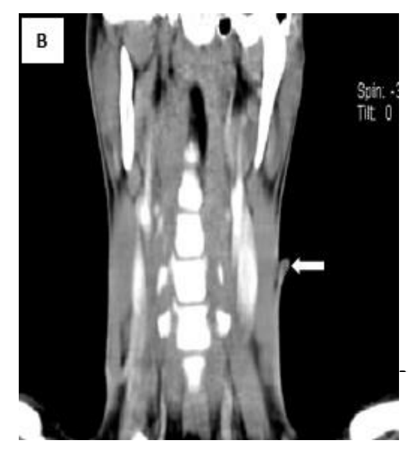
Fig 2. B: Spiral neck CT scan, coronal view. The sinus tract has been shown with an arrow as a low-density area just beneath the lesion.