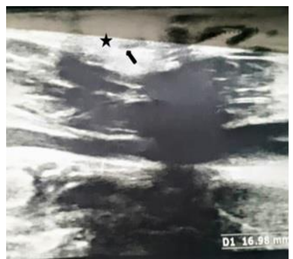
Fig 3: Sonographic findings showing the lesion (the asterisk) and sinus tract (the arrow)

The sonographic findings illustrated a mixed echo 4*8.5-mm lesion with small cystic particles, definite margins without vascular components superficial to SCM, with a 17-mm long tract beneath it. This tract arch was about 6 mm superiorly but did not penetrate underneath the muscle (Figure 3).