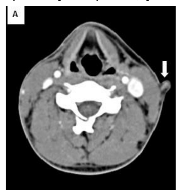
Fig 2. A: Spiral neck CT scan, axial view. The lesion with central cartilaginous density has been shown with an arrow.

In palpation, it was mobile, firm in consistency with no tenderness or erythema, and also no discharge in compression. No regional lymphadenopathy was palpated. Spiral neck CT scan illustrated a 9*4-mm soft tissue density containing a sinus tract which was located on the left middle 1/3 of the neck extended through SCM at the level of the thyroid cartilage to the hyoid bone (Figure 2).