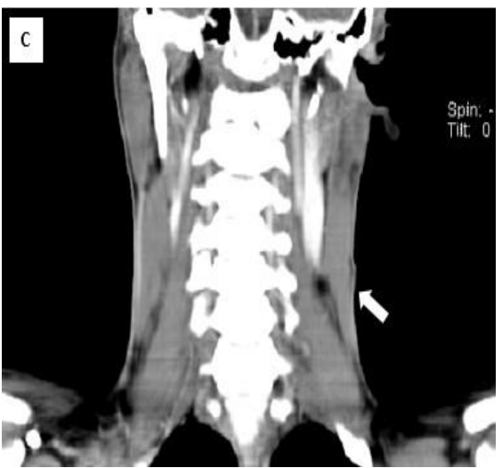
Fig 2 C: Spiral neck CT scan, coronal view. The tract extended superficially through SCM (the arrow)

The sonographic findings illustrated a mixed echo 4*8.5-mm lesion with small cystic particles, definite margins without vascular components superficial to SCM, with a 17-mm long tract beneath it. This tract arch was about 6 mm superiorly but did not penetrate underneath the muscle (Figure 3).