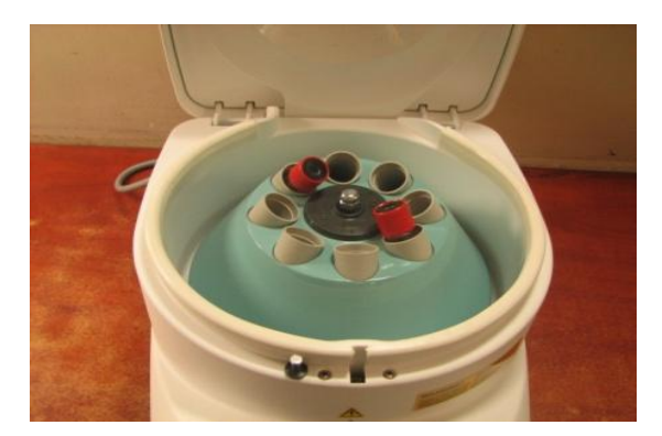
Fig 4: Table centrifuge

PRF is a natural fibrin matrix which was first developed in France by Choukroun and colleagues (5). The technique of producing PRF is very simple and needs nothing more than a blood sample and a PC-02 table centrifuge (Figure 4).