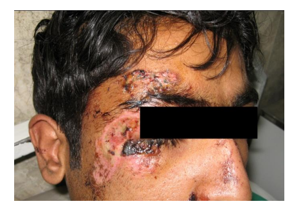
Fig 1: The avulsion area before treatment

A 24-year old man who suffered a motorcycle accident was referred to Shahid Kamyab Hospital. An examination of the subject revealed an avulsion of his periorbital skin that was 2 \times 3 cm in size (Figure 1). The patient had no medical history.