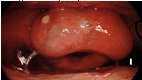
Fig 1: Pus Pointing Over Epiglottis.

A 48 year old man presented to our outpatient department with the history of absolute dysphagia, and fever for two days. On examination patient was febrile with drooling of saliva. Oropharynx was minimally congested. Indirect laryngoscopy revealed oedematous epiglottis with pus pointing over the lingual surface (Fig. 1).