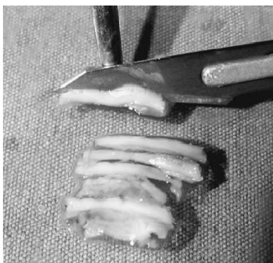
Fig 1: Photograph showing preparation of the cartilage.

In the patients who underwent palisade cartilage tympanoplasty, conchal cartilage was used in all cases. The perichondrium was removed from one side of the cartilage, and the cartilage was then cut into several slices with, on average, four or five palisades placed in an over-under fashion (two placed anterior to the malleus handle and two or three placed posteriorly). The remaining perichondrium was left attached to the cartilage slices on the lateral side. The perichondrium layer removed at the beginning of the procedure was then laid on the cartilage palisades, so that all the unwanted small openings between the slices were covered to improve the healing process. In the patients who underwent tympanoplasty where the temporalis muscle fascia was used as a grafting material, the graft was harvested from the ipsilateral deep temporal muscle fascia and placed lateral to (over) the long process of the malleus and medial to (under) the drum remnant and anterior annulus. Gelfoam was placed both medial (to the middle ear) and lateral to the graft, and the wound was closed using absorbable sutures. Figure 1 shows the preparation of the cartilage strips and Figure 2 shows a schematic image of the palisade cartilage tympanoplasty.