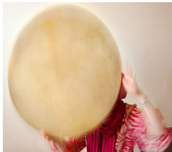
Fig 1: A daf player

tuned (Figure1). To date, no article has analyzed the daf intensity and frequency range and its effect on the vestibule. Thus, our aim is to use cVEMPs to evaluate the possibility that daf music may have a disturbing effect on saccular function.