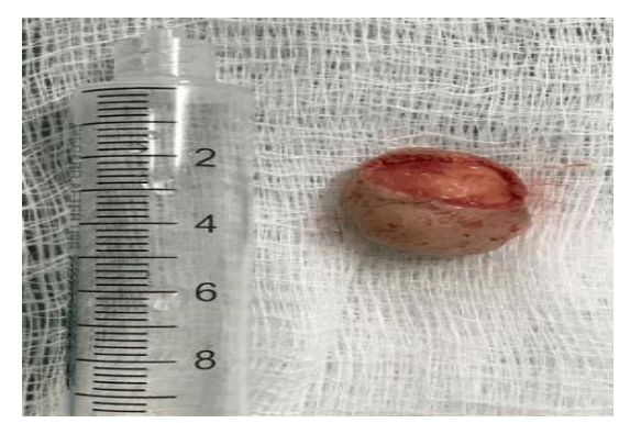
Fig 2: Image of the tumor after resection.

The patient was taken to surgery, and complete resection of the lesion was performed, removing a small segment of skin from the vestibular area without exposing the alar cartilage and without compromising nasal support or aesthetics (Figure 2).