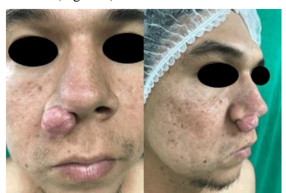
Fig 1: A. Front view of lesion in the right nasal ala, before the surgical procedure. B Lateral view of the same lesion.

The mass had a rounded contour and a rubbery consistency, with a pedicle base to the right lateral nasal vestibule. Its outermost portion involved the skin of the alar ridge due to its size, which allowed it to oscillate, a characteristic that the patient took advantage of by introducing it endo-nasally as a way to hide the mass. In addition, the lesion had the presence of ectatic vessels on its surface, which were smooth. (Figure 1).