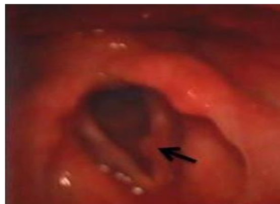
Fig1: Rt side vocal cord nodule

recovered fully. Indirect laryngoscopy (IL) four months and one year after the surgery confirmed complete healing with normal mucosal wave function and complete glottic closure.