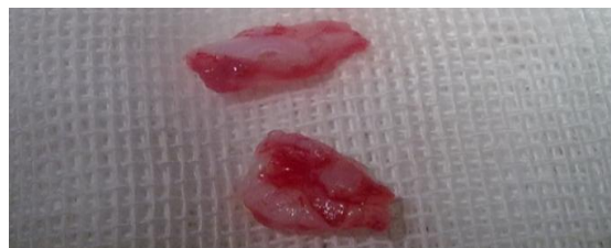
Fig2: Cricoid cartilage particles.

intervention. During the laryngofissure procedure, severe narrowing of the subglottic airway was observed due to multiple cricoid fractures and scar tissue formation. After exposing the laryngeal skeleton, an incision was made in the anterior midline of the cricoid lamina and deepened through the scar tissue to the posterior cricoid lamina. Then two lateral incisions (right & left) were made in the cricoid lamina. While preserving the mucosa in the midline incision edges bilaterally, the fractured cartilage particles and the scar tissue were removed via these two lateral incisions. The mucosal linings on the right and left side of the midline incision were sutured to a lateral position after debulking. Thereafter three cartilage particles were used to reconstruct the anterior cricoid lamina and to augment the lumen (Figs 2,3,4). Before arranging the cartilage particles, a vertical limb of a Montgomery T- tube was inserted as a stent in the reconstructed subglottic area and secured on both sides of the neck with two buttons.