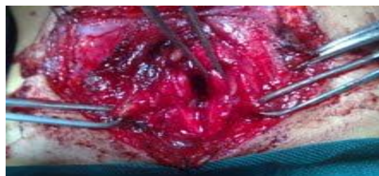
Fig 3: Extracting the fractured cartilage.