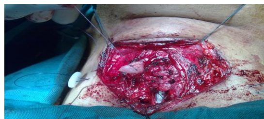
Fig 4: Stent is seen in the endolarynx, and the graft is to be placed in its final position.