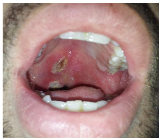
Fig 1: destruction of uvula with a destructive ulcer of the soft palate with a fibrinoleukocytic exudate.

One of them was about 2cm × 1 cm, extending from the soft palate to hard palate, exposing the underlying bone and another one was destructing the uvulae (Fig.1). The ulcers were covered with a thick fibrinoleukocytic membrane with erythematous borders. He had no history of such lesions. His oral hygiene was in good condition. Cervical lymph nodes were not appreciable. Disseminated hypopigmented maculopapular rash throughout the skin, from nine years ago, was also observed. Examination of vital signs revealed a blood pressure of 110/70 mm Hg, a heart rate of 80 beats per minute, and a body temperature of 100°F. The rest of his physical examination did not raise any concerns.