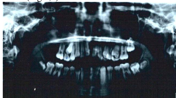
Fig 4: The panoramic view of the patient 4 weeks after surgery.

After a final histological diagnosis, the patient was submitted for surgical excision and enucleation of the lesion. The patient was taken to the operation room, under general anesthesia an incision was made intraorally. A full thickness mucoperiosteal flap from second incisor to the tuberosity was reflected. After bone removal of the sinus wall, access to the lesion was completed. The lesion and the impacted second molar were enucleated. Finally, histopathological examination of the last specimen confirmed the diagnosis of AFO. Postoperatively, after twelve months, no evidence of residual or recurrent disease was found (Fig.4,5).