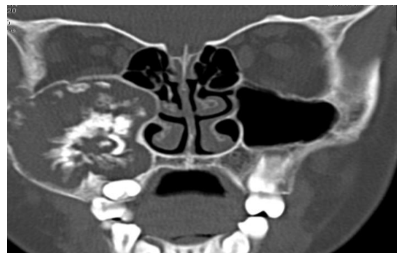
Fig 1: The coronal CT scan demonstrates a very large mixed tumor in the right maxillary sinus. Notice to the size of the lesion and extending to eye floor and wall of the nose.

Intra-orally, a bony hard bulge was palpable in the maxillary vestibule. A full complement of the teeth with the exception of missing second molar was marked able. Oral mucosa was normal and tooth mobility was not seen. Radiographically, computerized tomography scan (CT) showed a well-defined, radiolucent lesion in the maxillary sinus which contained several radiopaque materials of varying sizes and shapes (Fig. 1).