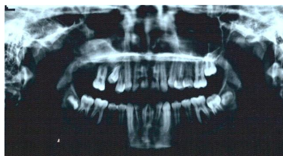
Fig 5: The panoramic view of the patient 12 weeks after surgery. The right second premolar is in eruption.