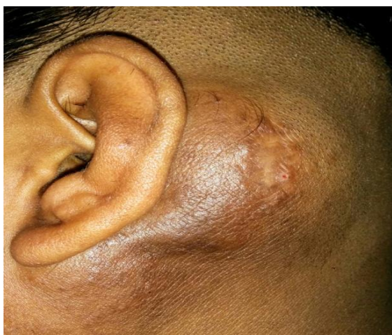
Fig 1: Clinical Photograph

An 18-year-old male presented with left postaural swelling, which was progressively increasing for 8 years. Occasionally, he complained of itching over the swelling. During clinical examination, the swelling was observed to be approximately 5 x 4 cm, solitary, non tender, firm, with ill defined margins (Fig.1). The overlying skin was thickened and erythematous. There was associated bilateral cervical lymphadenopathy. No similar swelling was found anywhere else in the body. There was no family or personal history of similar swellings.