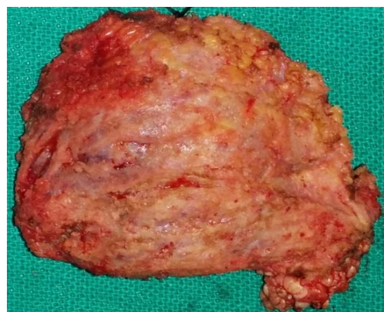
Fig 3: Postoperative Specimen

Meanwhile the patient was given oral steroids, anti-histaminic and diethylcarbamazine but failed to achieve any reduction in the size of the swelling. Therefore, surgical excision of the swelling was performed under general anesthesia. Intraoperatively, the swelling was found in the subcutaneous tissue and was easily dissected out from the surrounding tissue in toto (Fig.3).