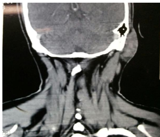
Fig 2: Ct Scan Showing Enhancing Lesion In The Subcutaneous Plane

showed a homogeneously enhancing lesion in the subcutaneous plane (Fig.2).