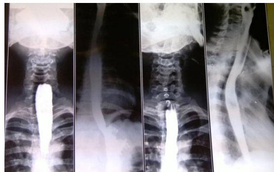
Fig 1: Esophagography

Pathology of the specimen macroscopically showed a piece of brownish colored tissue (1.5×1×1.5 cm in size). Microscopically, sections revealed skin tissue with the dermal tract lined by bland squamous epithelium, compatible with a clinical diagnosis of pharyngocutaneous fistula (Fig.2).