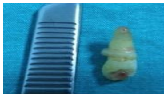
Fig 3: Postoperative photo of the left intranasal ectopic tooth (2cm in length).

Extension of the right nasal cavity was minimal. The patient was operated under general anesthesia. After removing the left sided deviation of the cartilage septum, we observed a hard white colored bone, which looked like a tooth and was vertical to the direction of the nasal sill. The left ectopic tooth was excised using punch forceps. It was 2cm in length. The root of the tooth was 1cm in length (Fig.3).