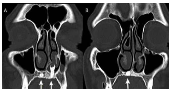
Fig 1: Coronal section of paranasal CT A: left ectopic tooth extended vertically in the intranasal cavity B: Right ectopic tooth extended horizontally in the intranasal cavity.

A 34-year-old man was referred to our clinic. His symptoms were left nasal obstruction, foul-smelling discharge, and occasional nasal bleeding. His symptoms had been lasting for three months. During physical examination, the foul-smelling discharge in the left nasal cavity was aspirated. On the left side of the nasal cavity, a hard, immobile, white colored mass was observed between the deviated nasal septum and nasal sill extending to the inferior surface of the inferior turbinate. The tip of the mass was covered with nasal mucosa. It looked like a tooth. On the right side of nasal cavity, we observed mucosal bulging on the nasal sill and right turbinate hypertrophy. The patient was asymptomatic on the right nasal cavity. A coronal section of a paranasal CT scan of the patient was observed and a mass of bone density arising from the left nasal cavity floor was seen (Fig.1).