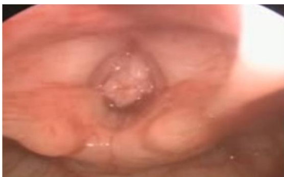
Fig 1: Laryngoscopy showing a mass in the free margin of the cords

On examination, the patient's vital signs were stable. Systemic examination did not reveal any abnormality. Flexible laryngoscopy showed a polypoidal mass approximately 1 × 1 cm in size in the free border and the undersurface of the right vocal cord extending down to the subglottis (Fig.1).