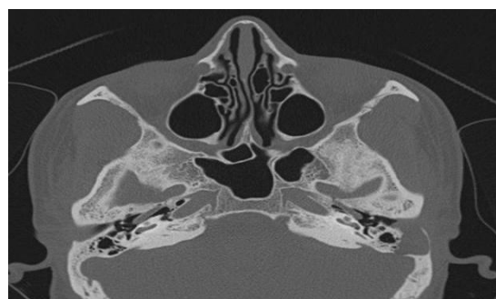
Fig 2: HRCT Temporal Bone revealing erosion of posterior wall of external auditory canal by Cholesteatoma.

external auditory canal eroding the posterior wall and extending into the mastoid bone impinging on the sigmoid sinus plate (Fig.2).