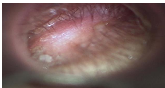
Fig 1: Epithelium covered bulge in the lateral part of external auditory canal.

A 25-year-old woman presented to our out-patient department with progressive hearing loss and blocked sensation in the left ear for of one and a half months duration. There was no history of ear discharge, ear pain, vertigo and tinnitus. There was no history of nose or throat complaints. Past history revealed a history of left myringoplasty six years prior to presentation. Clinical examination of the ear revealed a smooth, soft epithelium covered bulge in the lateral one-third of the floor and posterior wall of the left external auditory canal which was sensitive to touch and did not bleed on touch (Fig.1). Examination of the nose, throat and neck was normal. Systemic examination was normal.