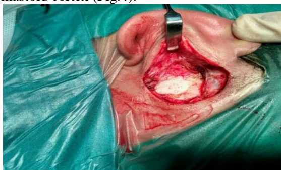
Fig 4: Intraoperative image showing the sac with cholesteatoma.

of the external auditory canal and eroding the mastoid cortex (Fig.4).