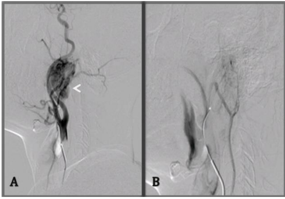
Fig 3: Pre-operative DSA and angioembolization of the lesion. (A) Pre-embolization-right common carotid artery angiogram and, (B) post-embolization -right external carotid arteryangiogram. Pre-embolisation run demonstrates signific