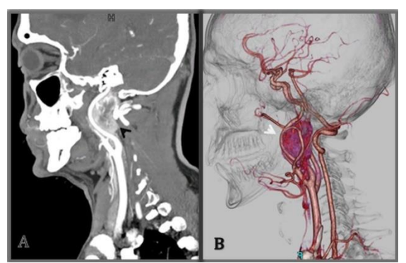
Fig 2: Pre-treatment CT Angiography of Carotid. (A) Post-contrast coronal section and (B) 3D reformatted image. An avidly enhancing highly vascular lesion (arrow head) behind the left internal carotid artery extending form the carotid bifurcation

The radiologist suggested it as an atypical glomus tumor or a rare peripheral nerve sheath tumor. With consideration of the location, clinical presentation, and imaging features, a working diagnosis of glomus tumor of the neck was made.