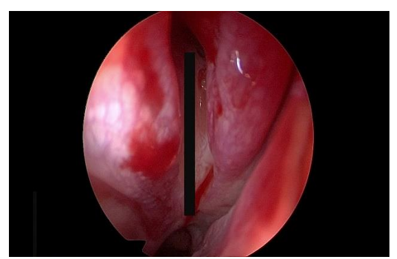
Fig 1: Measurement between natural ostium and the choana

This study also measured the opticocarotid angle, the distance between the pituitary gland and the lower wall of the sphenoid sinus, the distance between medial margins of the cavernous carotid artery and the inferior margin of the pituitary gland, and two carotid arteries at the longest axis.