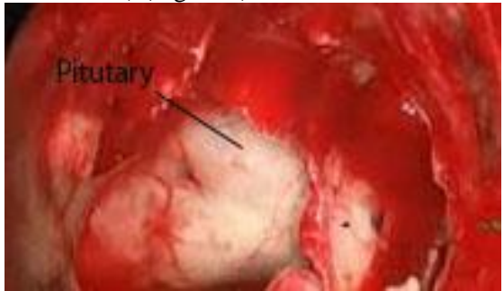
Fig 3: Pituitary gland

The mean distance between the anterior wall of the sphenoid sinus and the anterior nasal spine was estimated at 73.3\pm1.3 mm (distance range: 58.3-87 mm), and the mean distance between the anterior part of the middle of the pituitary gland and the anterior nasal spine was determined at 81.1\pm1.6 mm (distance range: 68-100 mm) (Figure 3).