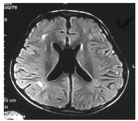
Fig 2: Periventricular focal gliosis in parieto occipital area in white matter