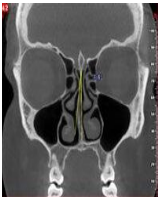
Fig 1: Measurement of the NSD angle in a sample case on the coronal cross-section

The presence of the following osteomeatal complex variations was evaluated in each patient: AN, NSD, CB, HC, PMT, and Pneumatized UP. The side and location of NSD (anterior, posterior, and middle) were determined and recorded based on the axial cross-section at the level of the inferior turbinate. The NSD angle was measured between the most deviated point of the septum and the midline on the coronal cross-sections (16) (Figure 1).