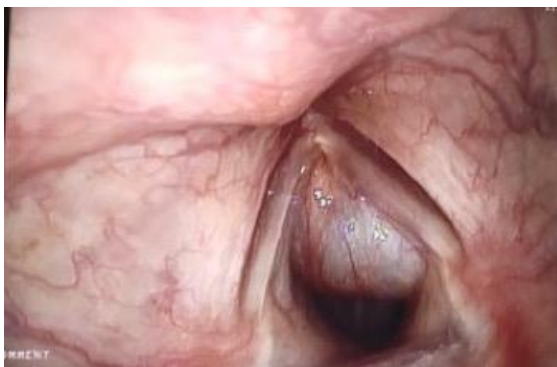
Fig 1: laryngoscopic picture showing an anterior subglottic cyst.

A thirty-year-old male presented to the outpatient department with a one-month history of dysphonia, following an episode of upper respiratory tract infection. He was a nonsmoker and had no history of throat pain, cough, difficulty in breathing or swallowing. On clinical examination, there was a 2x2 cm midline neck swelling which was unnoticed by the patient. The swelling was a well-defined cystic swelling which moved with deglutition and with protrusion of the tongue. Laryngoscopy revealed an anterior subglottic submucosal cyst with mobile vocal cords (Fig 1)