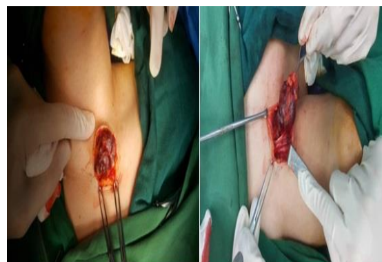
Fig 2: Intra-operative findings showed a partially encapsulated mass within the sternocleidomastoid muscle.

The pedicle of the mass in the muscle was ligated, and the swelling was excised completely. Furthermore, there was no recurrence of the tumor at the 6-month follow-up. Histopathological examination confirmed the diagnosis of cavernous hemangioma.