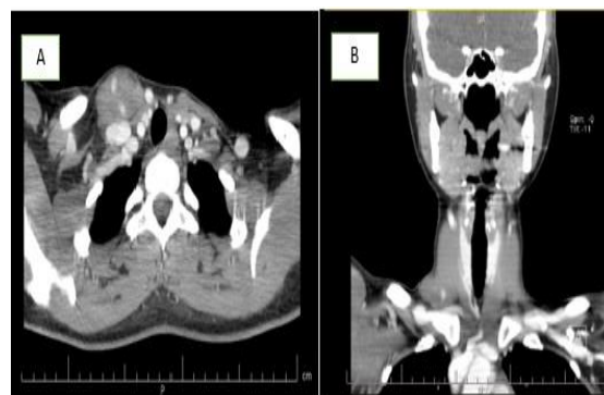
Fig 1: Axial (A) and coronal (B) CT images show heterogeneous enhancing solid mass measured 40×25×20 mm infiltrating the most distal part of the right sternocleidomastoid muscle in the base of the neck containing mottled hyperemic foci.

FNA repeated, which was bloody. According to the findings, the decision was made to perform surgery. The surgical dissection showed a thrombosed vascular mass of the supraclavicular region originating in the sternocleidomastoid muscle (Figure. 2).