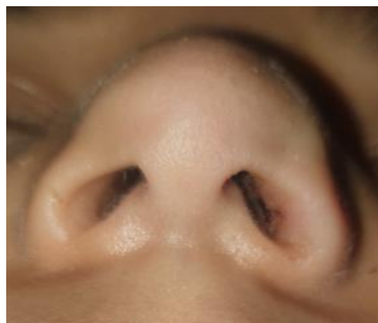
Fig 3: Image of the patient at the postoperative follow-up