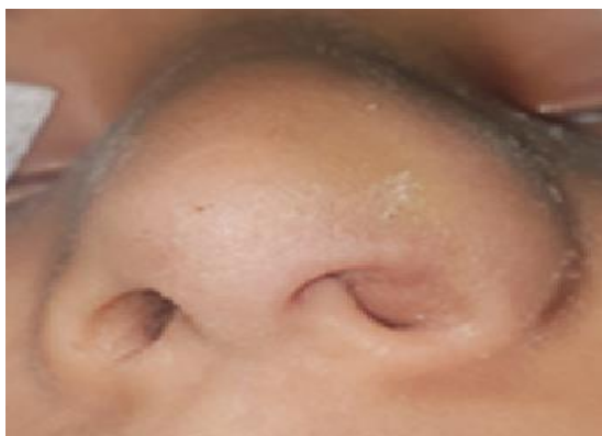
Fig1: Intraoperative image of alar cartilage hematoma

Swelling was observed in the left alar region of the patient's nose. No septal hematoma was detected on anterior rhinoscopy. No septal hematoma was detected on anterior rhinoscopy. Swelling and hematoma were observed in the patient's left alar cartilage. (Figure 1).