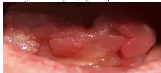
Fig 3: Complete recovery on the third month follow-up appointment

His condition was managed conservatively, with broad-spectrum antibiotics, while awaiting natural auto-amputation of the necrotic tissue, which occurred on the fifth day. The area healed by secondary intention. On the 3-month follow-up consultation, the patient denied glossodynia, which allowed him to further progress his oral uptake. The physical examination revealed total healing of the tongue (Figure 3).