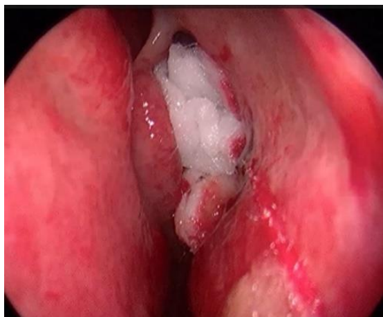
Fig 1: Endoscopic view of the left nasal cavity showing 5-FU-soaked cotton pledget placed in the middle meatus

A 0.9% saline solution was used to dilute 1 mL of 5-FU (1000 mg/20 mL). Under direct endoscopic visualization, a cotton pledget soaked in 1 ml of diluted 5-FU was inserted into one middle meatus, which was designated as the "test" nasal cavity. The 'control' group received a saline-soaked cotton pledget that was positioned contralaterally. A maximum of five minutes was allotted as contact time. The side selected for topical 5-FU application was randomized via random number generator. The content of both patties was kept unknown to the operating surgeon and the patient. A saline wash was given post-operatively. A non-absorbable nasal pack was placed post-procedure and removed after 24 hours.