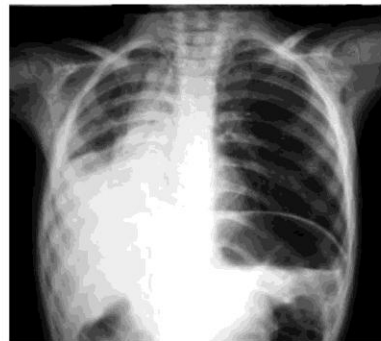
Fig 3: A 4 years old boy presenting by abdominal Pain and respiratory distress. Atelectasis of the lower right lung is noted. A watermelon seed was found in the right mainstem bronchus during bronchoscopy.

While emphysema and hyperlucent lung observed in early stage of foreign bodies, atelectasis or consolidation indicates fairly advanced stage (13) (figure 3).