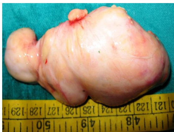
Fig3: Smooth encapsulated excised retropharyngeal tumor (8.0x5.0cm)

wound closure was done after achieving haemostasis. The excised specimen was sent for histopathological examination after fixing with formalin. Intra-operative and immediate post-operative periods were uneventful and the patient was kept on Ryle's tube feeding post-operatively for 2 weeks. Histopathological examination showed a pale, firm, smooth, capsulated soft tissue tumor of a 8.0 X 5.0 cm size (Fig. 3). Microscopic examination showed round to oval adipocytes admixed with collagen and fibrous septa (Fig. 4), which was suggestive of fibrolipoma. The patient was followed up at 3 months, and then had 6 monthly follow-ups for 2 years. No recurrence was observed.