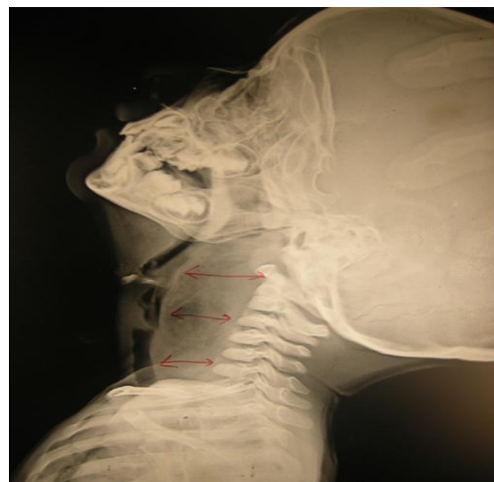
Fig1: X Ray soft tissue neck (Lateral view) showing increased prevertebral soft tissue shadow from C1 to C7 vertebra displacing the airway anteriorly without any air-fluid level.

muscles and underlying vertebrae were normal (Fig. 2). A provisional diagnosis of retropharyngeal lipoma or teratoma was made. Intraoral surgical excision was planned.